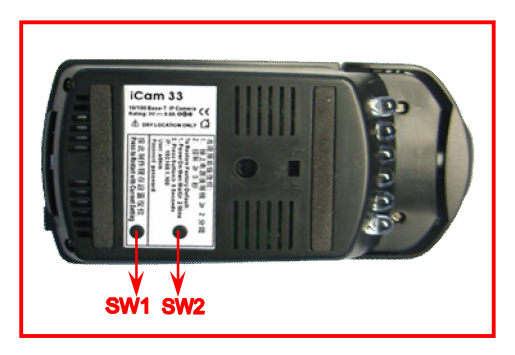
Figure 1. CAM77IP Network Camera Bottom View